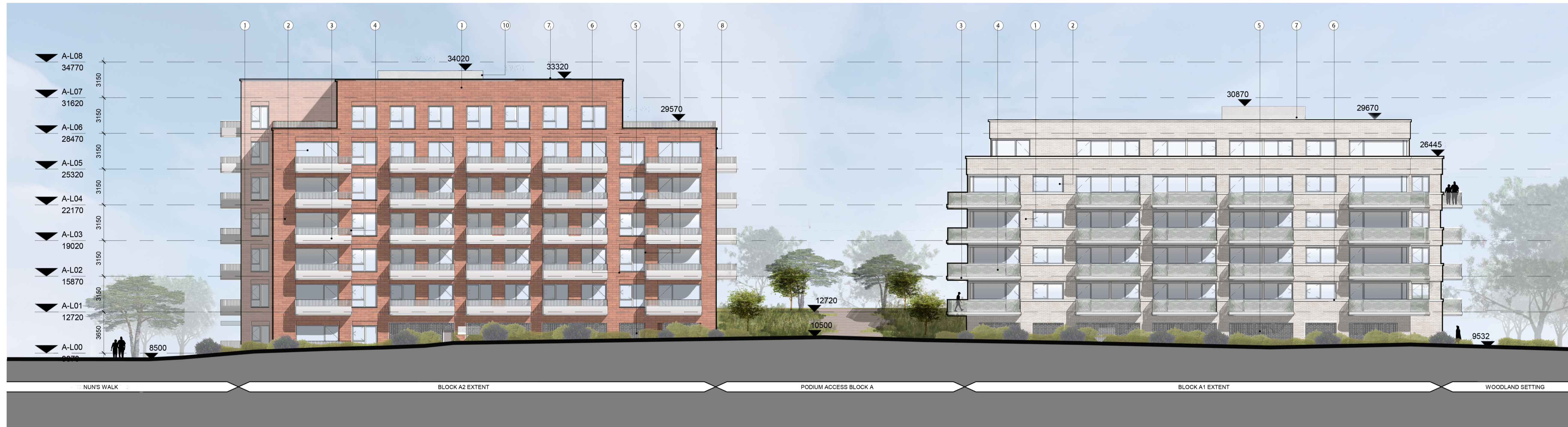
Block A - East Elevation 1 : 200